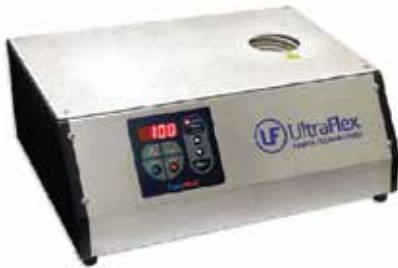
Induction Melting Furnaces Easymelt