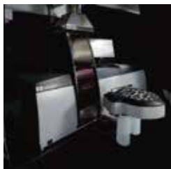
Atomic Absorption Spectrometer AA500