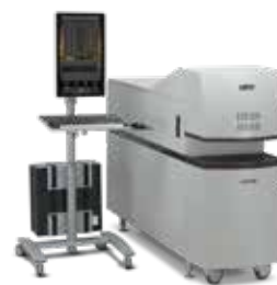
Glow Discharge AES GDS900