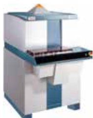
X-Ray Fluorescence (XRF) 9900