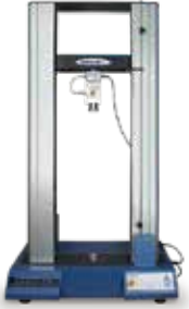
Universal Testing Machines Omnitest