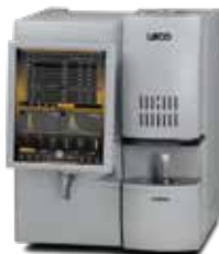
Carbon & Sulfur Analyzer CS844