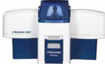
Particle Size and Shape Analyzer Sync