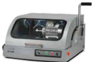
Sectioning/Cut off Machines