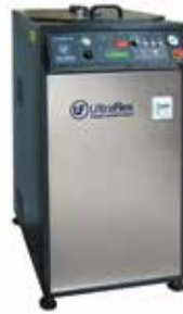
Casting Machines EasyCast J