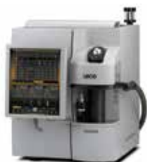
Oxygen, Nitrogen & Hydrogen ONH836