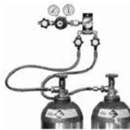
Gases Lines Installation