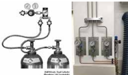
Gases Lines Installation

Expensive equipment requiring a connection to a gas cylinder sometimes encounter problems because of low quality gas lines (leaks, corrosion, impurities and moisture)