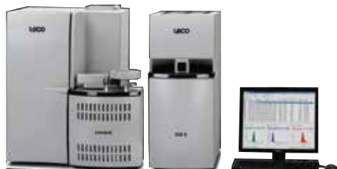
Ultimate Analyzer (CHNS) Carbon, Hydrogen, Nitrogen and Sulfur