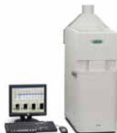
Ash Fusion Determinator AF700