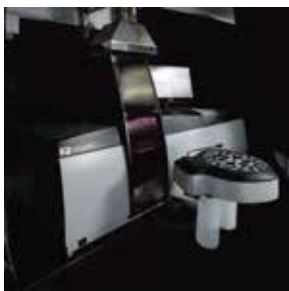
Atomic Absorption Spectrometer AA500