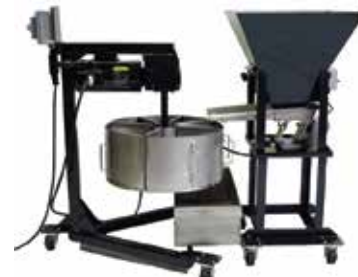
Rotary Sample Divider