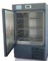
Air Drying Oven

Automatic determination using Image Recognition Function