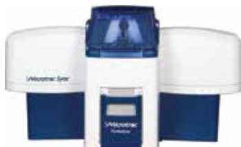
Particle Size and Shape Analyzer Sync