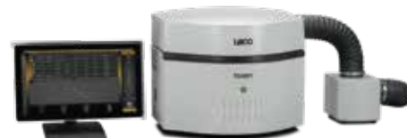
Automated Proximate Analysis Moisture, Volatiles, FC and ASH Thermogravimetric Analyzer (TGA)

Automatic alternative to the oven and furnace method