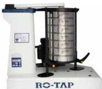
Sieves and Sieve Shaker