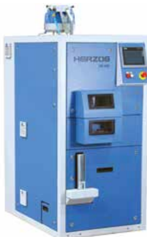
Automatic Pulverizing Mill and Pellet Press

Fine grinding and preparation of pellets in steel rings (40 or 51.5 mm diameter) for XRF spectroscopy