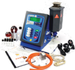
Flame Photometer (Na, K, Ca, Li, Ba) BWB XP

1 sample prep/sample for XRF and XRD analysis