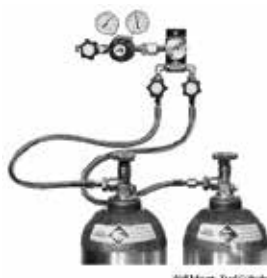
Gases Lines Installation