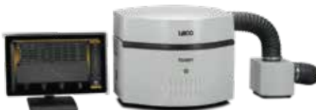
Moisture, Ash and LOI Analyzer Thermogravimetric Analyzer

Automatic alternative to the oven and furnace method