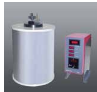
Differential Calorimeter ToniCAL

improves consistency by removing human error through automation