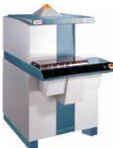
X-Ray Fluorescence (XRF) 9900