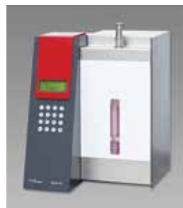
Auto Blaine Device ToniPERM

improves consistency by removing human error through automation