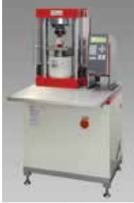
Compression and Flexural Machine ToniZEM

Automatic, Servo Hydraulic machine in the accuracy class 1 category