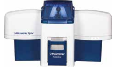
Particle Size and Shape Analyzer Sync

Uses a controlled temp recirculating water to maintain temp and relative humidity close to the manual method