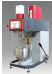
Auto Cement Mixer ToniMIX