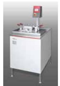
Vibrating Table ToniVIB