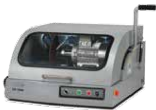
Sectioning/Cut off Machines