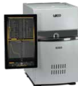
Carbon and Sulfur Analyzer SC832

Carbon and Sulfur in cement and coal samples by dumas/combustion method