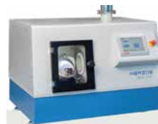
Electric Fusion Machine

Fine grinding and preparation of pellets in steel rings (40 or 51.5 mm diameter) for XRF spectroscopy