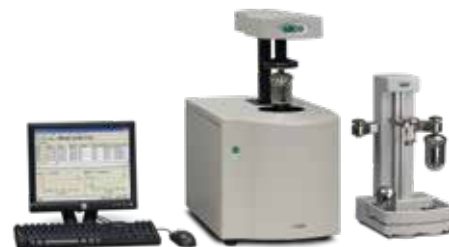
Semi Automatic Bomb Calorimeter AC600