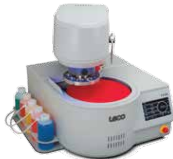
Grinding and Polishing Machines