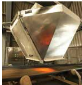
ONLINE AIRSLIDE ANALYZER

Online analysis of CaO, Al 2 O 3 , SiO 2 , Fe 2 O 3 and H 2 O in the material passing through the crossbelt