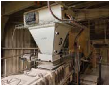
ONLINE CROSSBELT ANALYZER