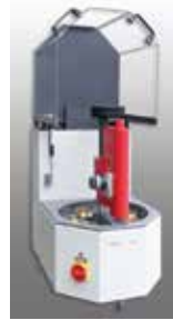
Automatic Vicat Machine ToniSET

Configured according to ASTM, EN or BS standards